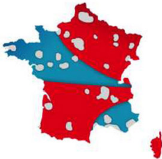
Figure 17 - A simplified map of the zones operated by SFR (in red) and Bouygues Telecom (in blue), made public by the parties in February 2014. Zones in grey are excluded from the project.

The agreement also sets out a temporary 4G roaming service provided by Bouygues Telecom to SFR for a small part of the mutualised area, in order to avoid deploying temporary equipments that would have to be dismantled and replaced by the target network.